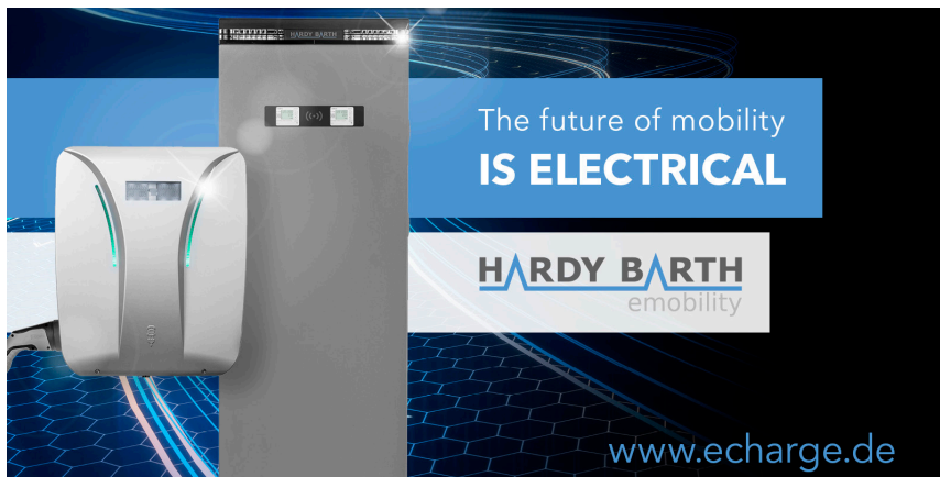
Contactless eCharging service ecosystem with Multi-Application Support

To support this growing ecosystem around eCharging stations, eCharge Hardy Barth , a provider of eMobility solutions based in Germany, has partnered with LEGIC to create eCharging stations that support secure user authentication, ePayment, monitoring as well as multi-application capability that easily integrates customer loyalty services on the same smartcard or Android/iOS mobile app.