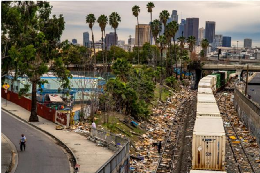
(US) New York Times, 20.01.2022.

A Union Pacific rail hub in Lincoln Heights has increasingly become a target for thieves, who are leaving behind packages.