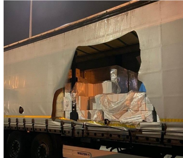
(UK) iNews, 08.10.2022.

An i investigation has established how organised crime gangs across Britain are running a sophisticated operation stealing from HGVs and selling the goods back into the legitimate supply chain, with 'amazing' profit margins